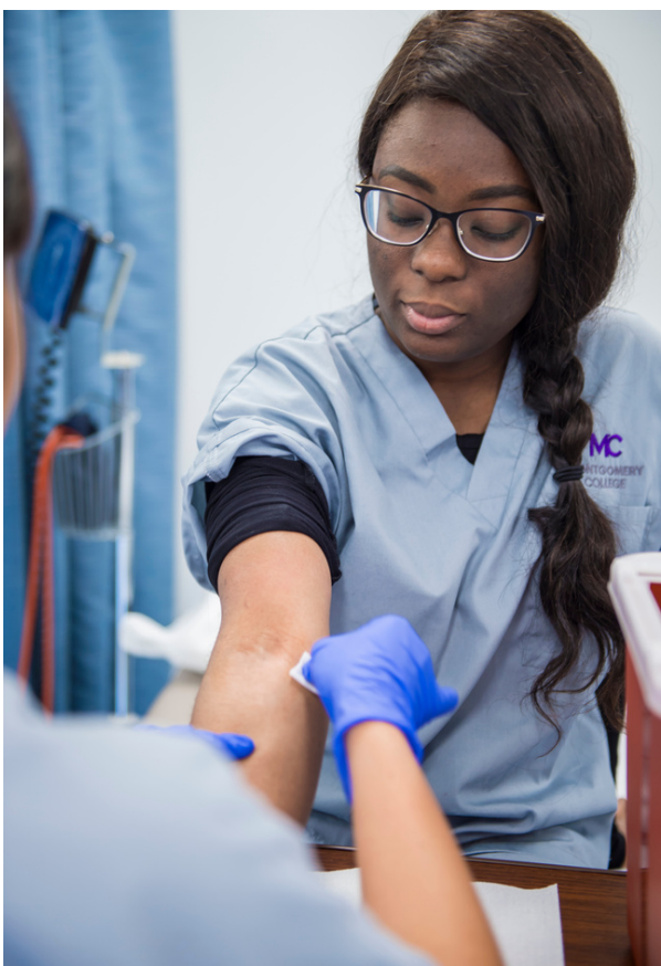
MC Health Sciences students hone their skills, practicing "sticking" each other.