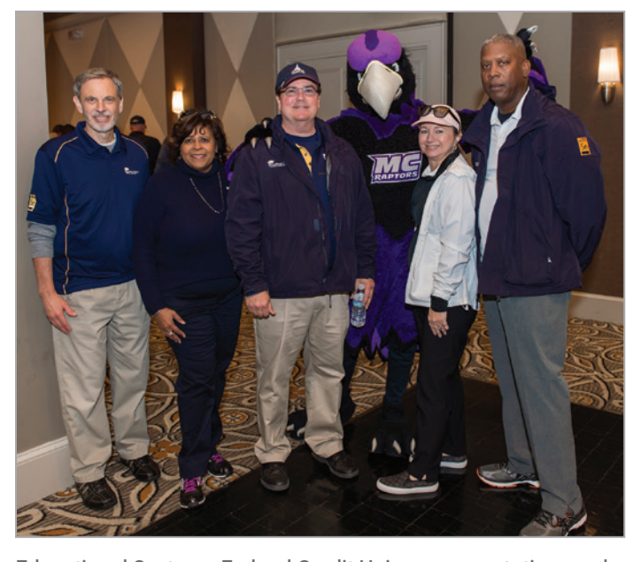
Educational Systems Federal Credit Union representatives and the Raptor.