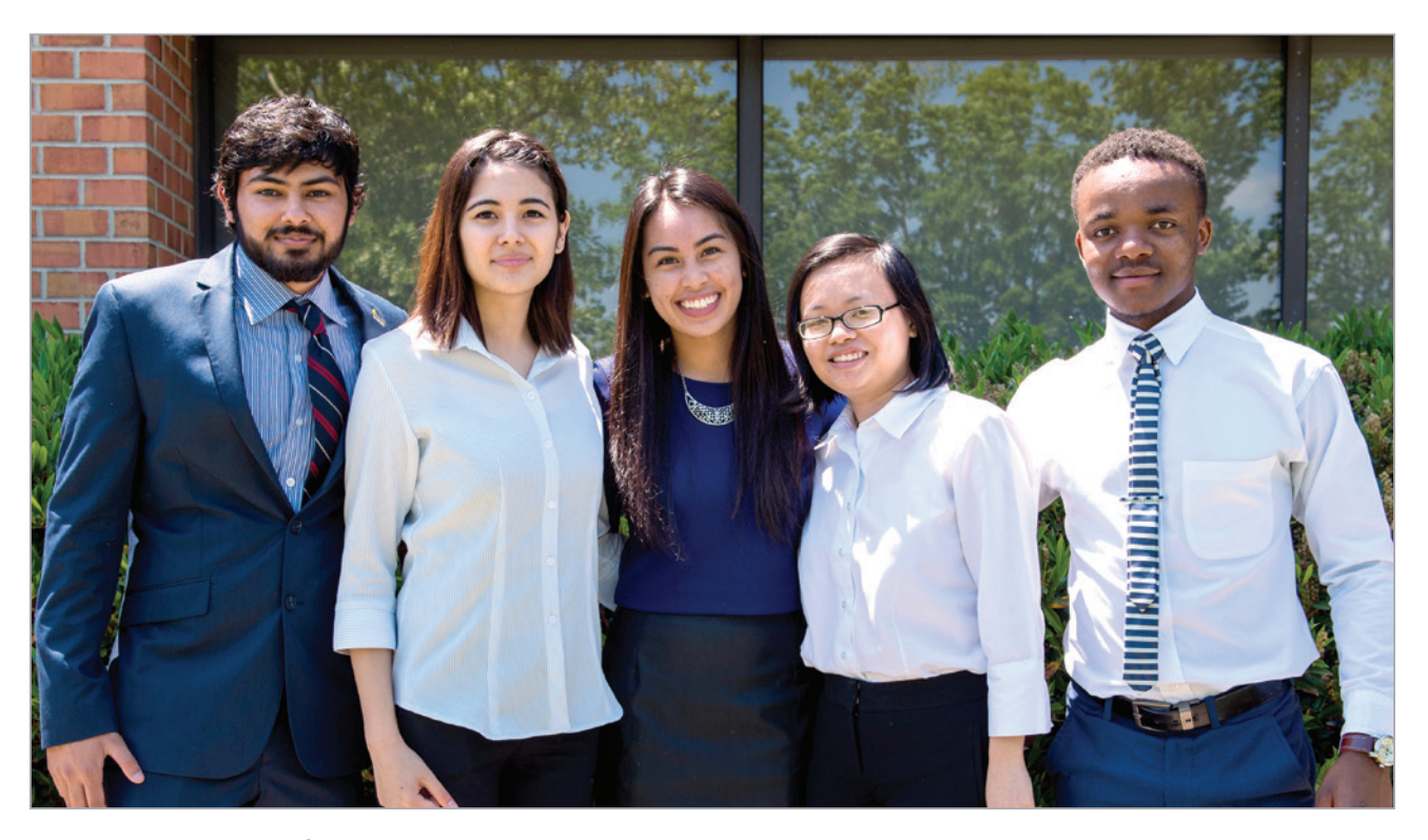
Students who are part of the Hillman Entrepreneurs Program will get a chance to attend a two-day Entrepreneur and Small Business Symposium.

In addition, Guardian offers MC students its Money Management for Life<sup>SM</sup> program. This alliance with community colleges across the country, including Montgomery College and the University of the District of Columbia Community College, provides free personal finance courses that earn college credit. These courses educate students, and provide a solid foundation of information that will allow them to build the skills to manage their own money and plan for their educational and financial futures.