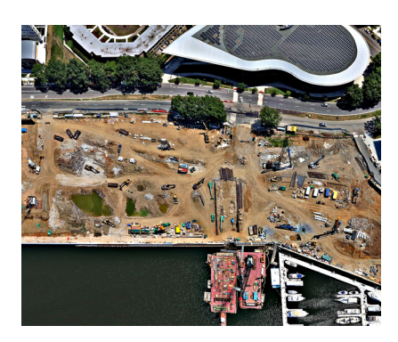
The District Wharf Washington, DC

IN MULTIFAMILY PROJECTS BY THE MID-ATLANTIC TEAM